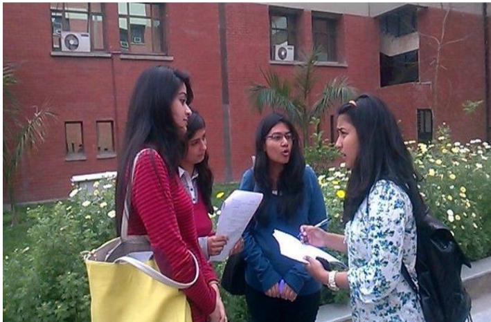
Pic3: Team collecting data