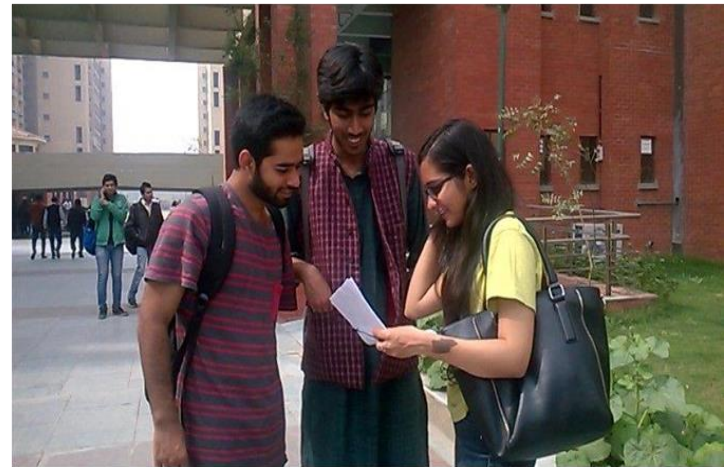
Pic2: Core team recruiting volunteers