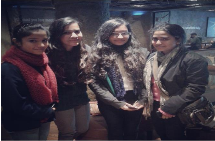
Pic1: Core Team members